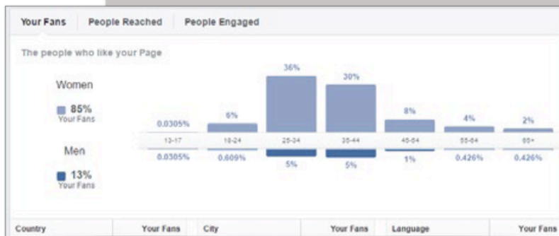
Facebook's advanced analytics